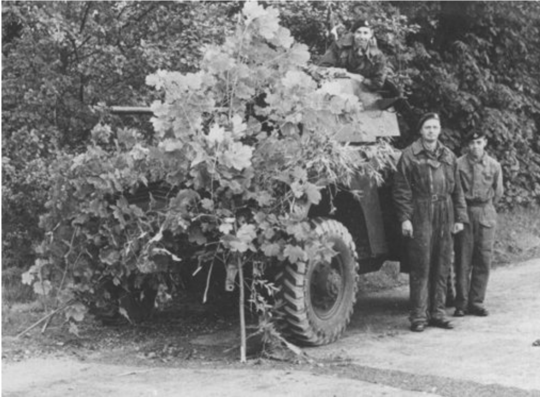
Royal Irish Horse at kircudbright camp 1952