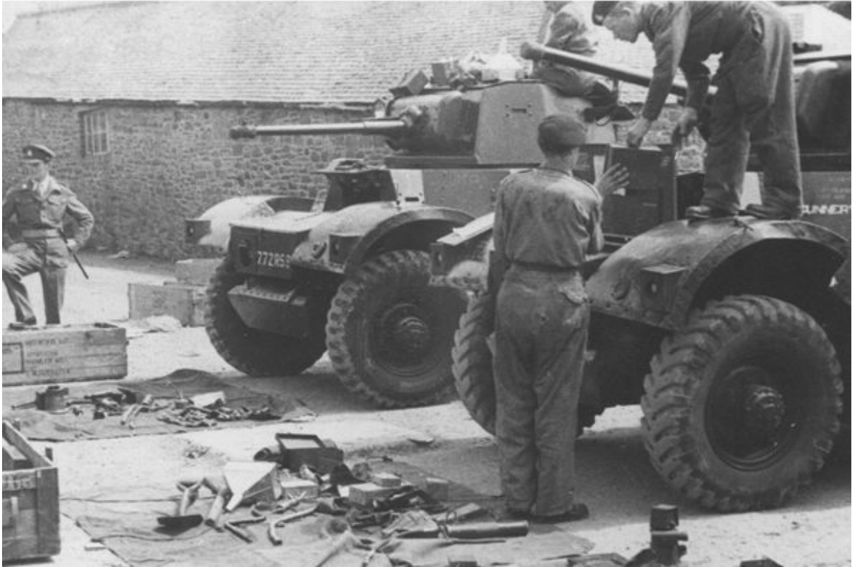
Daimler armoured car 72 SR 58 and another named GUNNER Royal Irish Horse at kircudbright camp1952