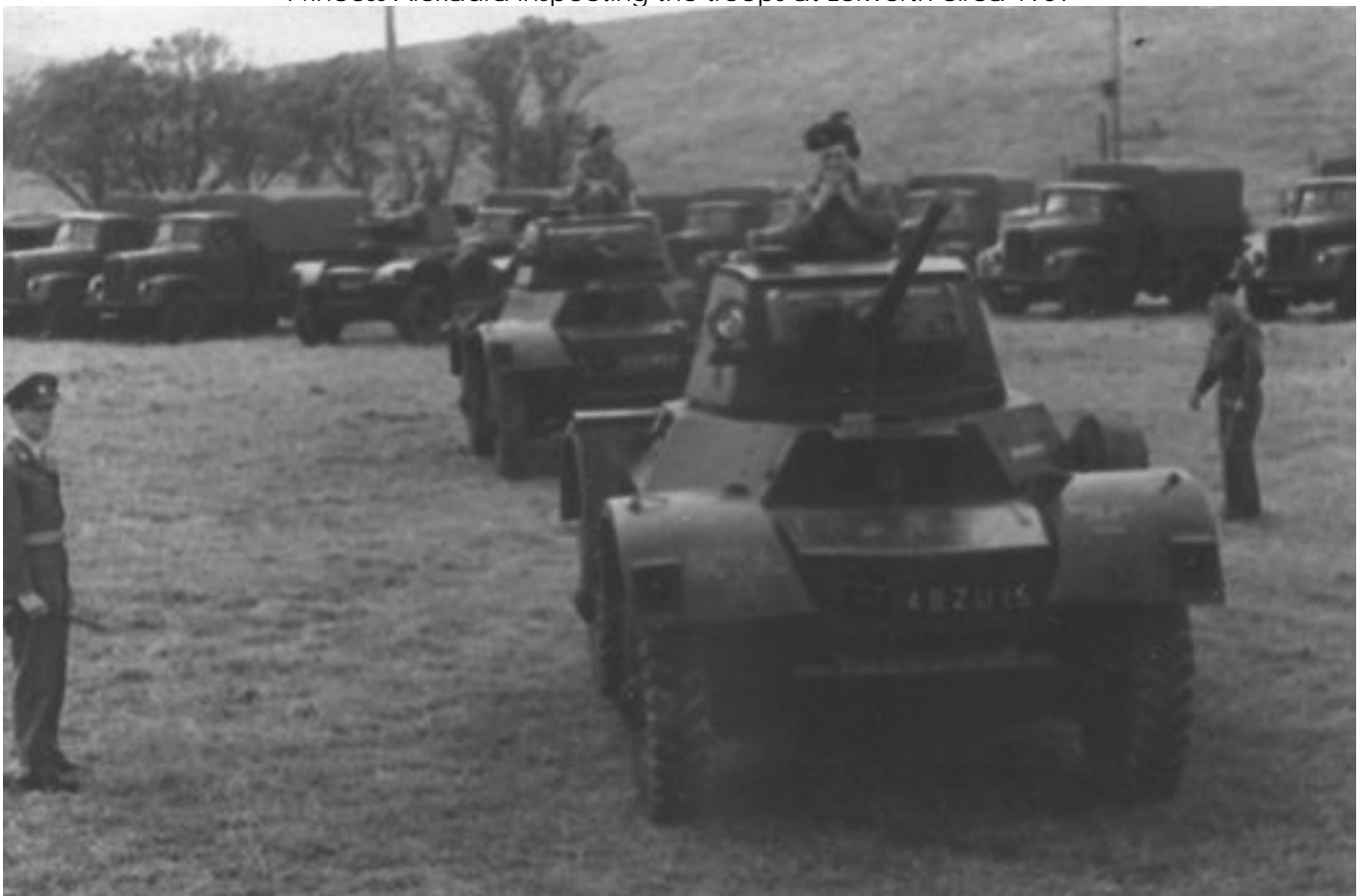
Daimler armoured car 49 ZU 15