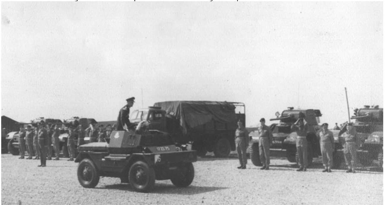
Princess Alexandra inspecting the troops at Lolworth circa in car F47962 02ZS75 Circa 1969