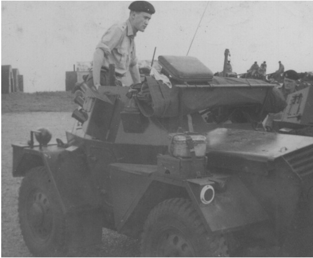
Lulworth training Area circa 1961