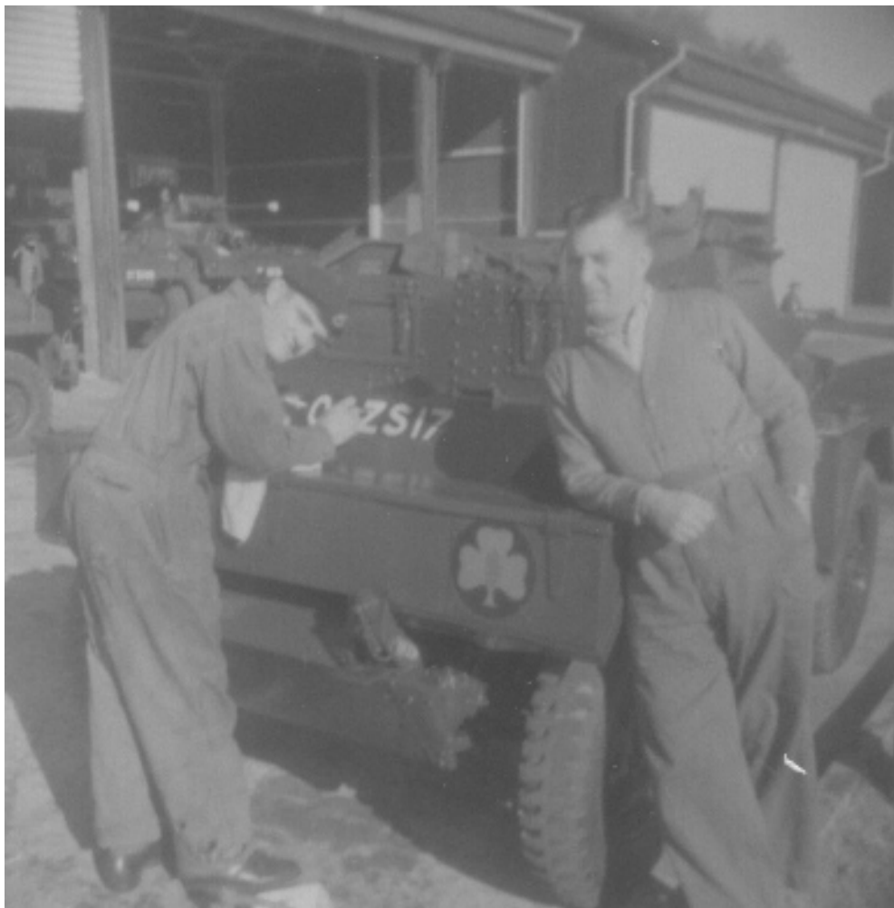
Dingo F207034 / 01ZS17 or F207021 / 04ZS17 at the 'Old Comrades Day' circa 1960