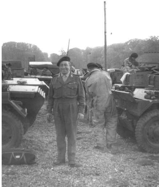
Lulworth training Area circa 1961