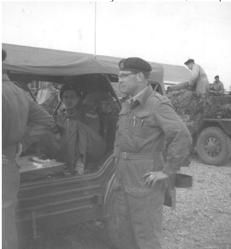
Lolworth circa 1969