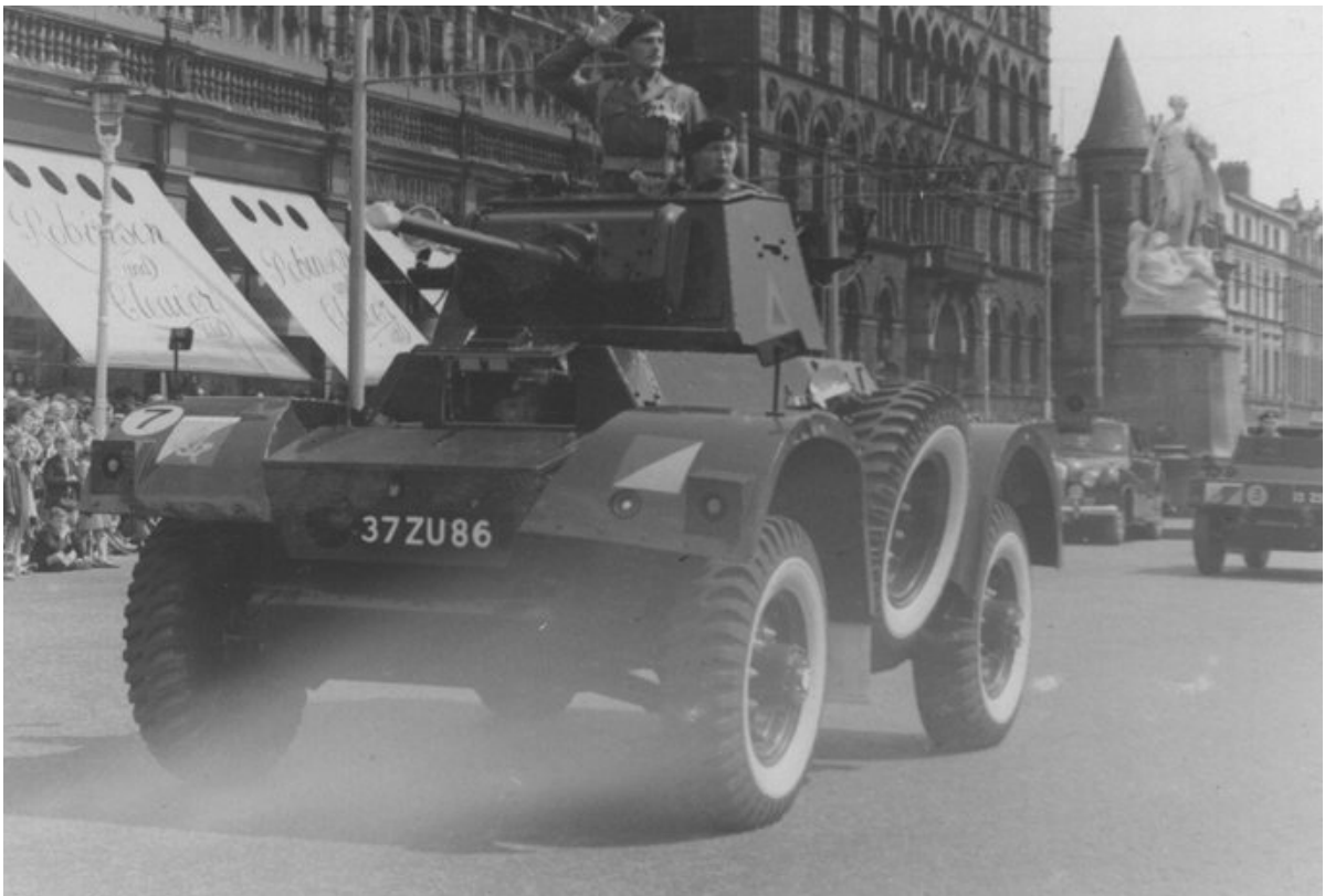
Daimler armoured car 37 ZU 86