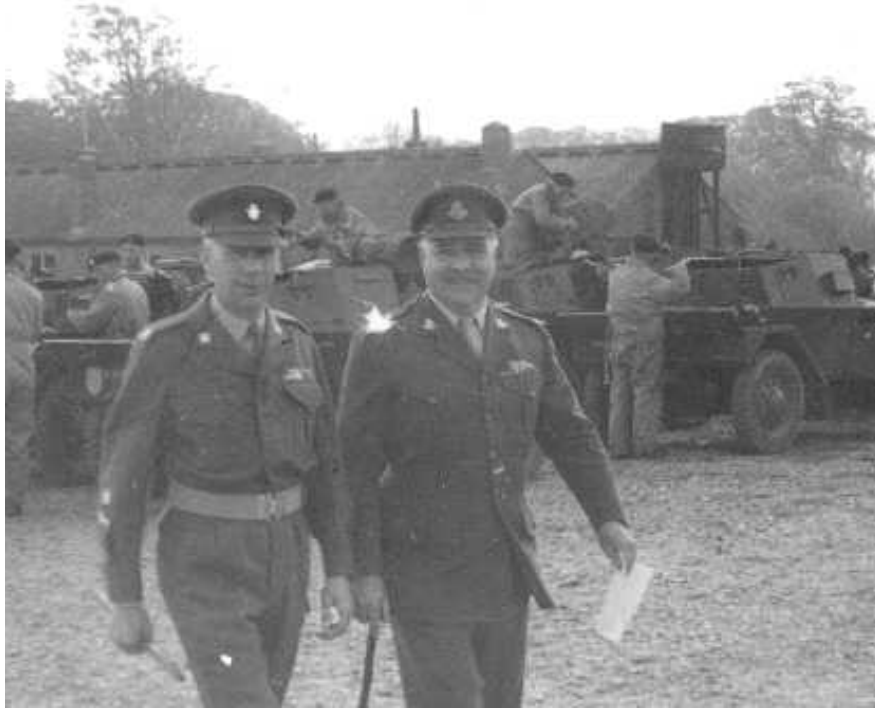
Lulworth Cove Training Establishment circa 1961