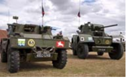
Royal Irish Horse at kircudbright camp1952