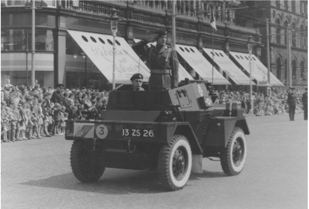
Car F132526 / 13ZS26 at the Lord Mayor of Ulster show ,1956 Cpl beardmore