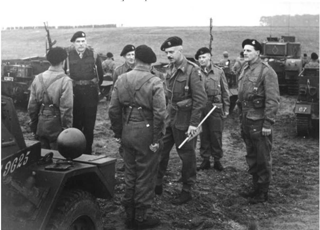
Brig RH Maxwell inspecting the troop and car numbered F329625 at Thetford circa 1962